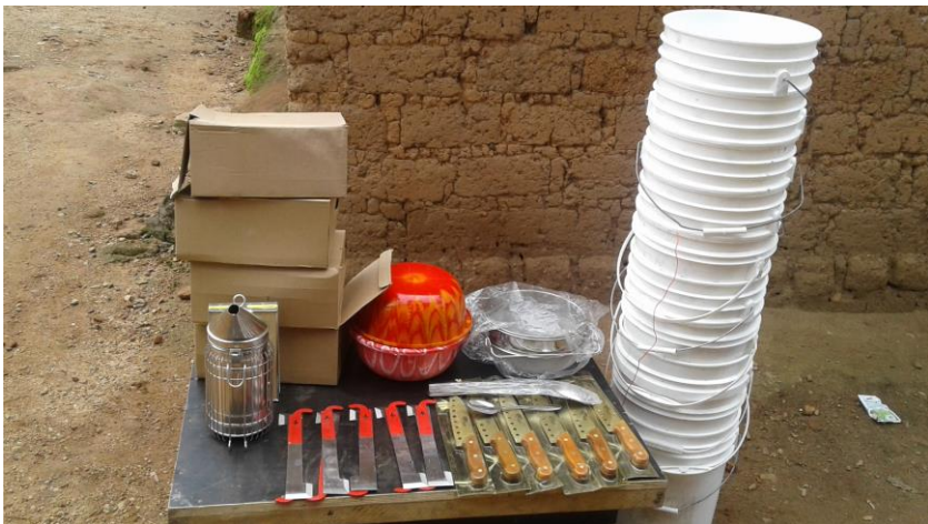
Jarbor-Jarkei (Talk & Do) Beekeepers Association of Kpagamai